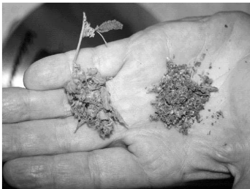
FIGURE 3. Cannabis before and after vaporization in the Volcano, Hash Marijuana Hemp Museum, Amsterdam, Holland, June 2001.

The disadvantages of vaporization are, that you require a device which costs much more than a pipe or cigarette papers, and that using a vaporizer effectively is not as easy as smoking a joint.